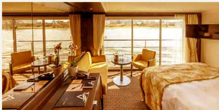
Panorama Suite Category A, B, P

Trier – Germany’s oldest city with ancient Roman remnants dating from 144-152 AD. Starting from Port Nigra walk through the city Center, OR: Join a history-focused Roman Trier Guided Tour to learn more about the history of Roman civilization in this Moselle River city, and visit the ruins of a 20,000-seat amphitheater and imperial baths. This afternoon, take a Guided Optional Excursion to Luxembourg City—with its dramatic views, ancient ruins, and modern architecture in its deep gorge terrain. Later, enjoy live entertainment on board while cruising to Bernkastel. (B,L,D) EVENING/OVERNIGHT CRUISE TO BERNKASTEL